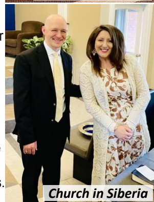
Church in Siberia