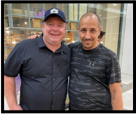
I was surprised and glad to see my Jewish friend I met a couple years ago. He sells Dead Sea products in the malls in Thailand and just happened to be in Bangkok when I was.

"And some have compassion, making a difference" Jude 22