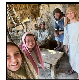
Volunteering at Nazareth Village

304-702-5295 - Jewishawareness.org - P.O. Box 1808 Angiers, NC 27501