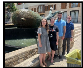
Interns arrived in Israel and first stop was Jaffa (Jonah and the whale)