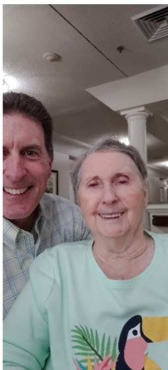
Dear Lady Got Saved