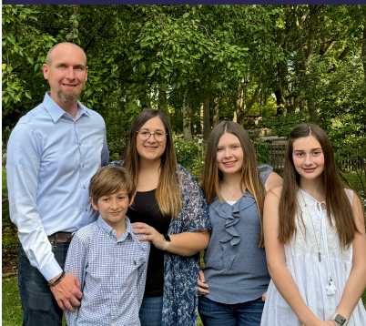
The Sinde Family

BOX 2313 LIOSATI, AFIDNES, 19014, GREECE