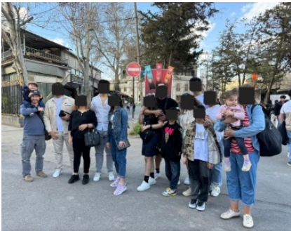
These were excited to receive Scripture!

We gave out quite a few Bibles both physically and digitally this month. Please pray both now and in the future that people with Bibles will be able to get home with them without issue. I have heard firsthand stories of God working at inspections to prevent Bibles from being found, and we pray that this continues.