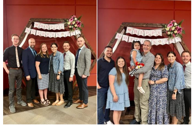
We were glad to be with both of our mothers on Mother's Day!